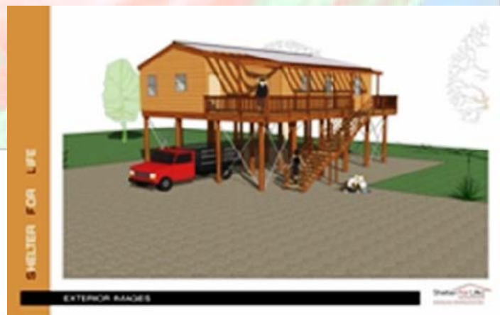
SHELTER FOR LIFE HOME

A VERY MERRY CHRISTMAS AND MOST BLESSED 2007 TO ALL Y'ALL!