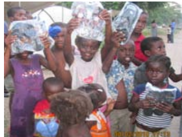
Children in a tent city in Jacmel show off their new shoes this past week.