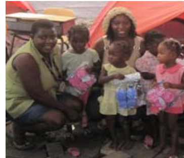
Children receive new shoes in a tent city in Leogane this past week.

Last week more shoes were distributed in tent cities in Jacmel and Leogane. Thank you for your continual support to help all these children and for showing them Mercy and Compassion. Click here to view photos