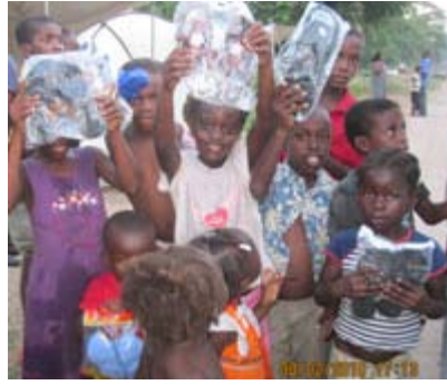
Children in a tent city in Jacmel show off their new shoes this past week.