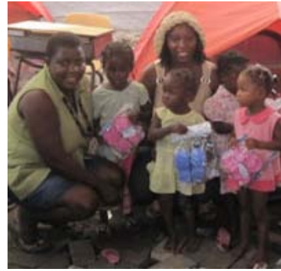
Children receive new shoes in a tent city in Leogane this past week.

Last week more shoes were distributed in tent cities in Jacmel and Leogane. Thank you for your continual support to help all these children and for showing them Mercy and Compassion. Click here to view photos