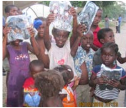
Children in a tent city in Jacmel show off their new shoes this past week.