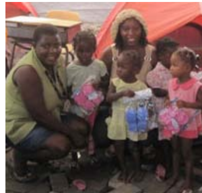
Children receive new shoes in a tent city in Leogane this past week.

Last week more shoes were distributed in tent cities in Jacmel and Leogane. Thank you for your continual support to help all these children and for showing them Mercy and Compassion. Click here to view photos