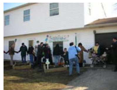
House Blessing House restored by volunteers

Plan now to join the team planning to go the week of Sept 12-Sept 18. Projects could include framing, hanging wallboard, mudding the wallboard, painting, sanding and staining woodwork. On the practical side a few people are needed to do the meal prep, grocery shopping and cleaning.