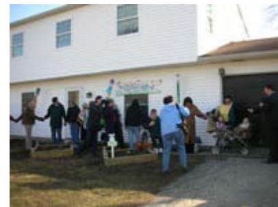
House Blessing House restored by volunteers 2008 flooding

Plan now to join the team planning to go the week of Sept 12-Sept 18. Projects could include framing, hanging wallboard, mudding the wallboard, painting, sanding and staining woodwork. On the practical side a few people are needed to do the meal prep, grocery shopping and cleaning.