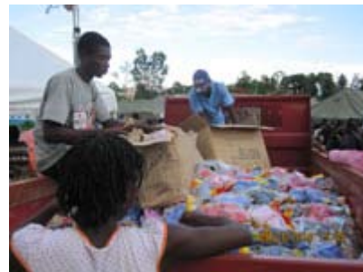
Shoes are distributed from a truck to hundreds of children in a tent camp.