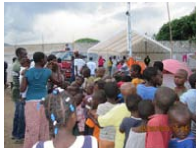
Hundreds of barefoot children are eagerly waiting in line for shoes that will help protect them against infection and disease caused by walking in mud and other hazardous materials in the aftermath of the earthquake.