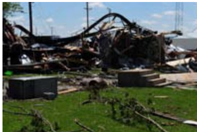
The mobile home park in Dwight was destroyed by the tornado.

More information on items that will be collected with be shared on the LCC website and at Emmanuel Lutheran Church in Dwight. Help share the Mercy and Compassion of Christ and Make A Difference! Thank you for your support.